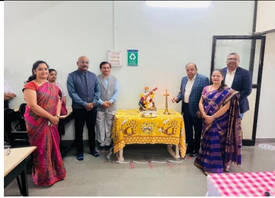
Saraswati Pujan By Guests